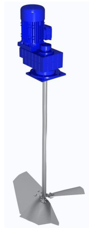
VPS3 mixer with parallel shaft gear.